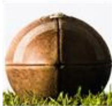
Denver starts a season 4-0 for the first time since 2001.

Both Ricky Williams and Anthony Dixon had 70 or more yards rushing against the Texans. Williams finished with 12 for 70 (5.8) and a long gain of 29, while Dixon led the Broncos in rushing with 17 for 71 (4.2) and a long of 13. Dimitri Nance kicked in another 40 yards on 9 rushing attempts (4.4).